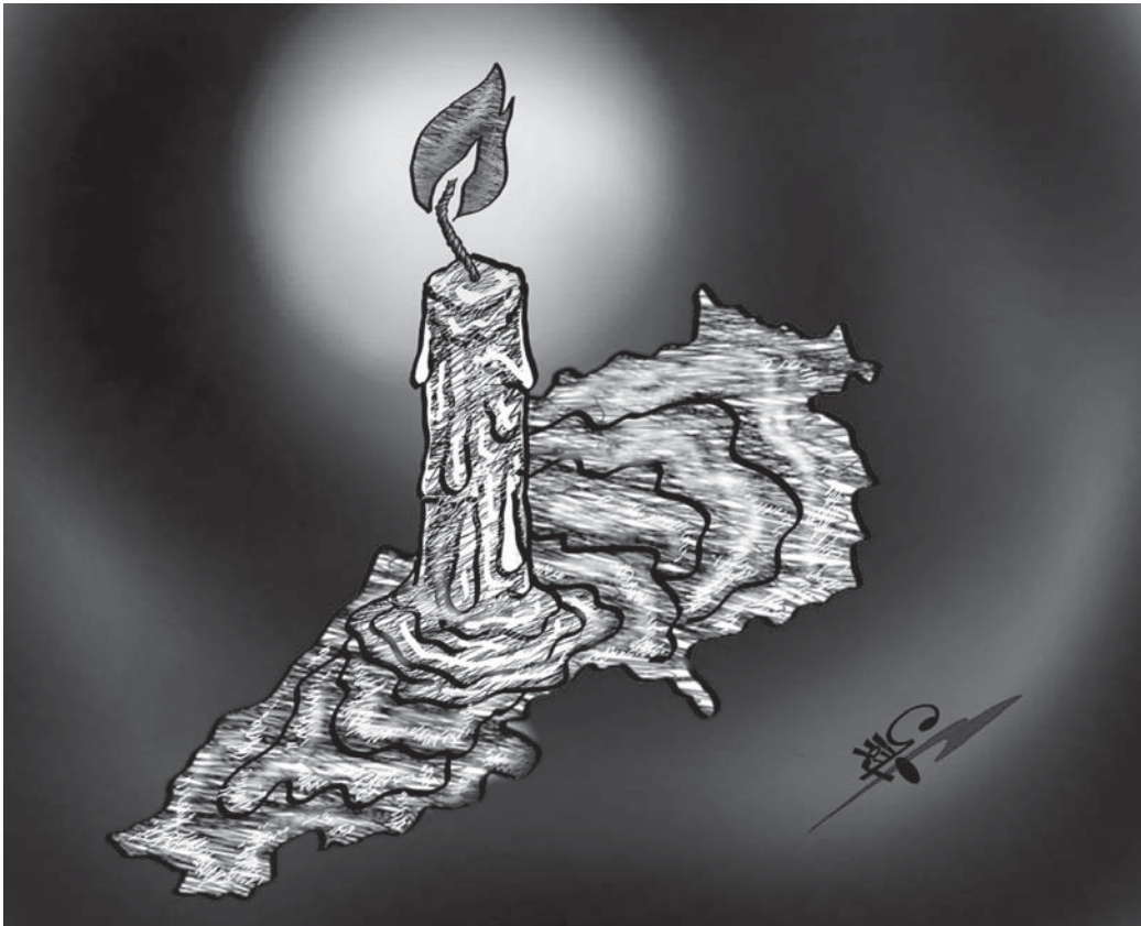
Figure 8.1 A smelting Lebanon, lit by candle

geography of the city. Through this, it produces a new urban politics, the subject of this chapter. As McFarlane and Rutherford argue, ‘the politics underpinning urban infrastructural transformation are rarely more evident or visible than in times of crisis or rupture’ (2008: 6). The electricity crisis is openly contested in the ‘back alleyways’ of the city (Bayat, 2009: 11) as much as in Parliament, on social networks through cyber-mobilisation, and on the streets through public demonstrations. This chapter thus questions how these new forms of electric ‘politics’ reframe broader ‘political’ domains in the city (Swyngedouw, 2011). In doing so, the chapter is in line with approaches which, within urban and infrastructure studies, displace the centrality of regulatory reform and the governance of the sector (Graham & Marvin, 2001; Coutard, 2008). Rather, its concern lies in an analysis of the impacts of infrastructure policies on the social fabric of cities (Monstadt, 2009; Jaglin & Verdeil, 2013; Rutherford & Coutard, 2014), unpacking issues of energy justice (Bickerstaff et al., 2013), particularly at an urban scale.