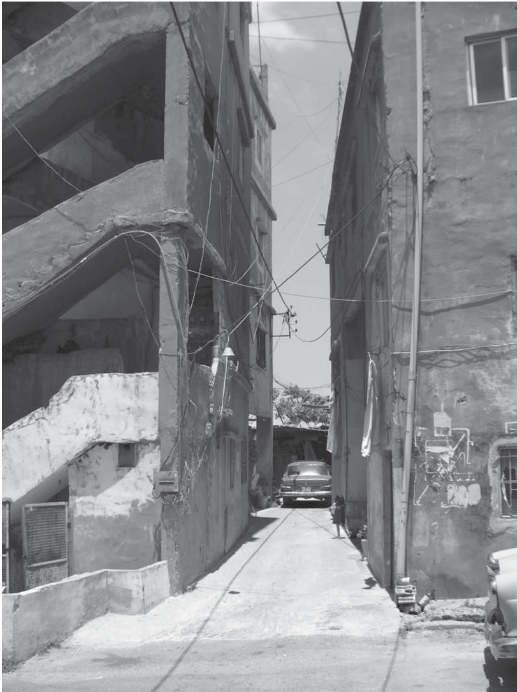
Figure 8.3 The grid of a generator in Zaatriyeh, a popular suburb east of Beirut