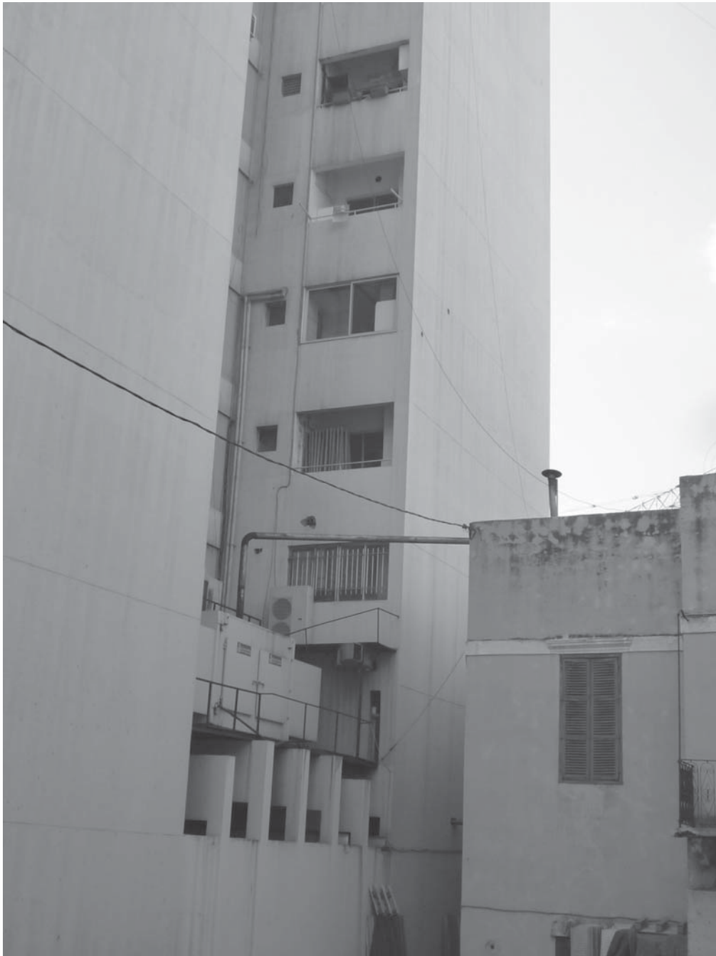
Figure 8.4 A generator serving a middle class building in Beirut, 2014